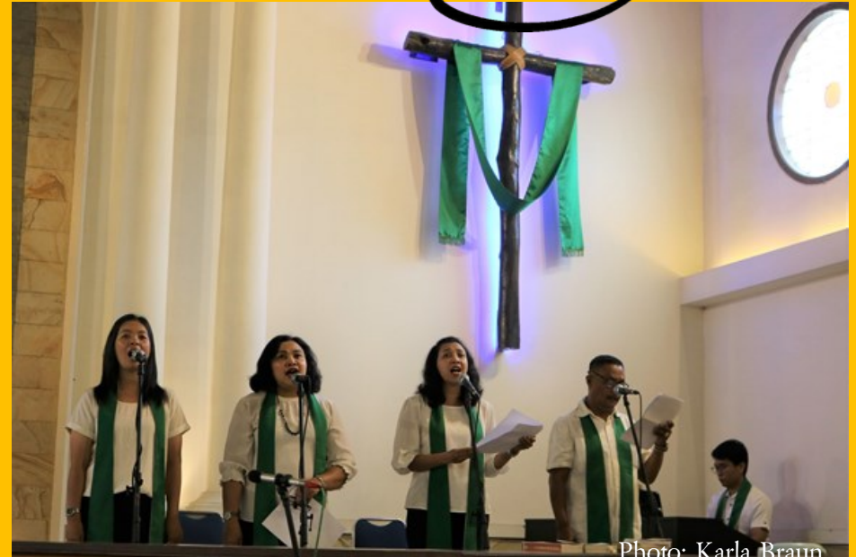
Song leaders at a GKMI congregation in Salatiga, Indonesia, in 2019